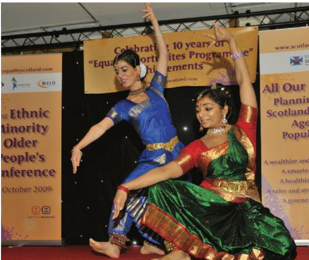
Indian Classical Dance