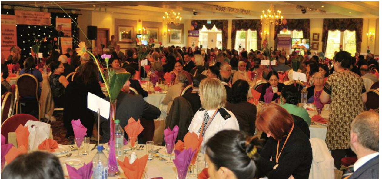
Guests at the Conference